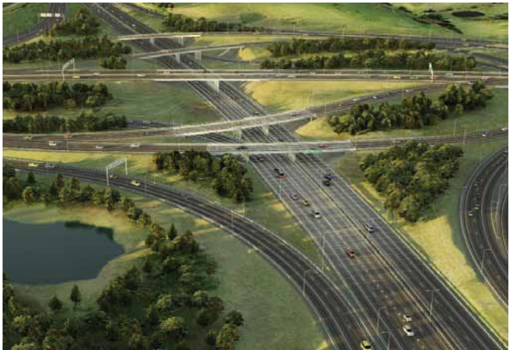
Aerial view of a highway with wireframe overlay. Designed in AutoCAD® Civil 3D® software. Rendered in Autodesk® 3ds Max® software.

AutoCAD® —foundational design, documentation, and communication